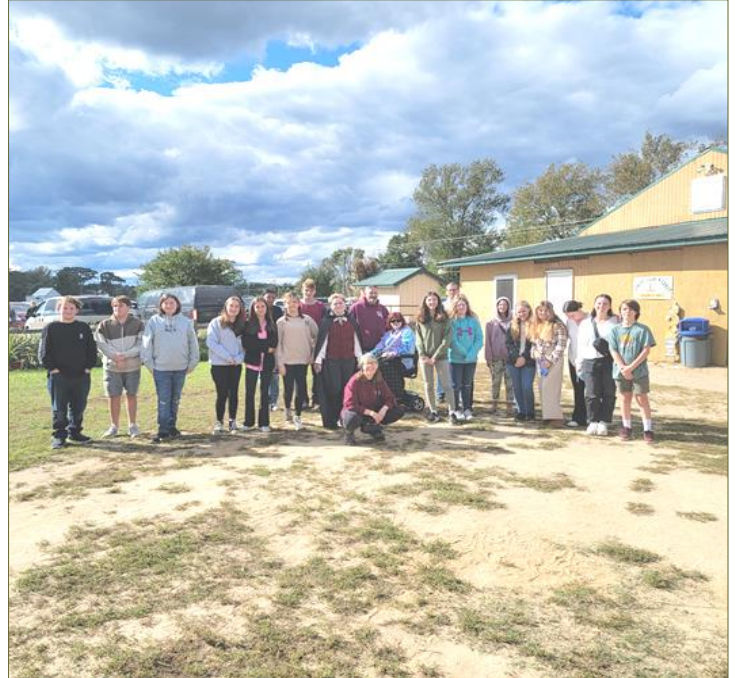
Pictures above: The Youth Group had a blast getting lost at the Adkins Market corn maze last month.